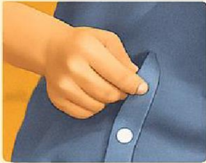
Button your shirt

Life skills refer to the skills which help the child to become confident and independent in life. Encourage your ward to do the following activities :-