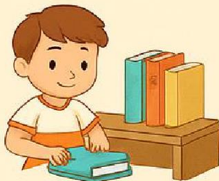
Arrange your books neatly