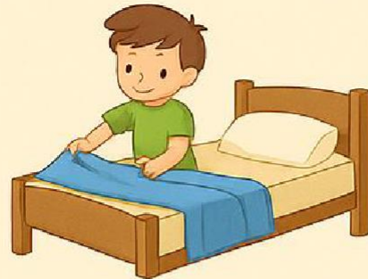
Learn to make your bed