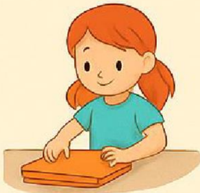
Learn to fold clothes