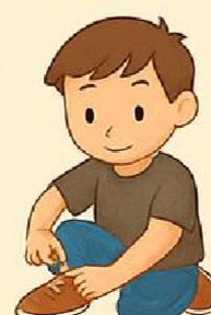
Tie your shoelaces