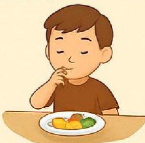
Chew with your mouth closed