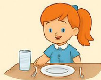
Learn to set the table